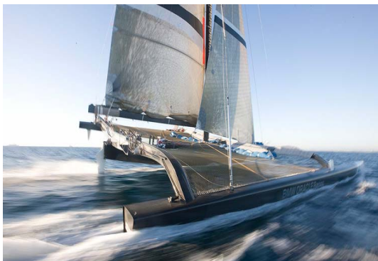
BMW Oracle “Dogzilla” in Light Air